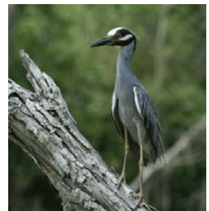
Yellow crowned night heron