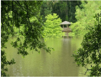
Gazebo, Hale Lake Point