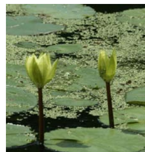
Water Lilies

The event will take the place of regularly scheduled programs.