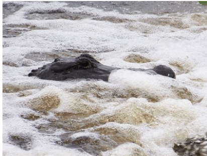
Gator at Spillway