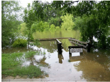
Hale Lake Fishing Pier