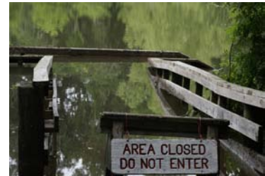
Hale Lake Fishing Pier Close up