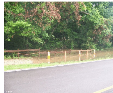
Road/trail by Wood Yard