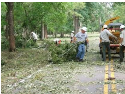
Debris Cleanup at BBSP

This week on Galveston Island, TPWD has been tasked to deploy 50 game wardens to meet with 100 DPS troopers to assist with law enforcement and traffic control. Today another game warden team is part of a recovery effort led by Chambers County on Smith Point, where much of the debris from Bolivar Peninsula communities washed ashore.