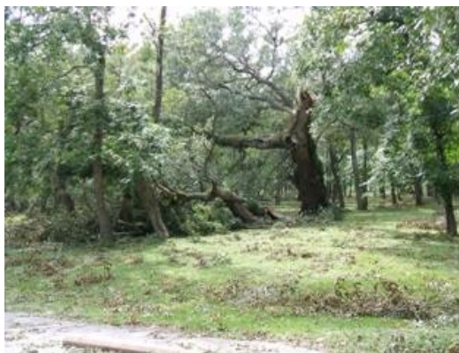
Damage from Hurricane Ike at BBSP

This morning, 17 Texas State Parks are closed due to Ike. More than 5,900 evacuees have been given shelter at 64 state parks outside Ike's path. These climbing numbers show evacuees are continuing to arrive at some parks, although many have departed since evacuees first started arriving last week.