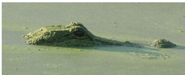
"Ike Survivor"