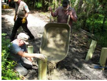
Live Oak Trail Bridge in progress