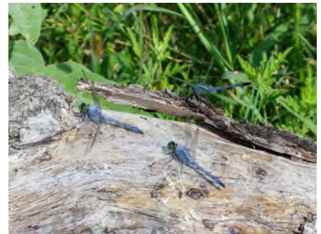
Photo sent by Ron Morrison, 8/18/12: These are some blue dragonflies that followed us a little while we were working on the Creekfield trail.

Checked and set hog traps several times throughout month and repositioned hog traps to Elm Lake Trapped 6 hogs Treated invasive plants on Creekfield Lake and Creekfield Forest Trails, at Viewing Areas Treated Chinese Tallow trees and Poison Ivy at viewing areas