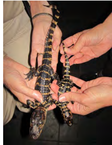
What a difference a year makes Diane Carpenter