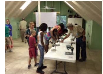
Pond Life Program