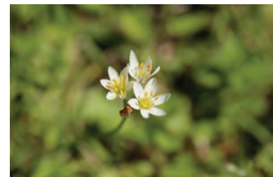
False Garlic

volunteers with an additional interpretive resource."