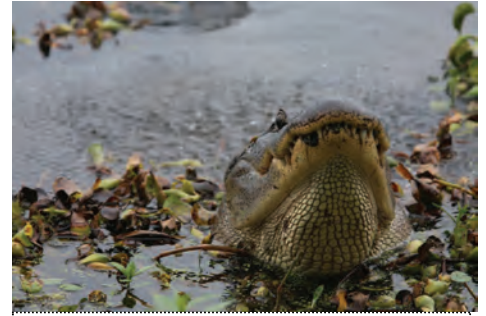
Alligator Bellowing

January: 4,985 NC visitors; 869 attendees to 37 program; 548 attendees to 3 special events